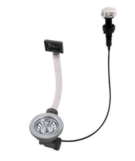
Automatic waste fitting 8407 100