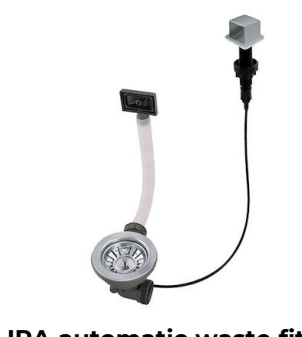
LIRA automatic waste fitting 8407 103